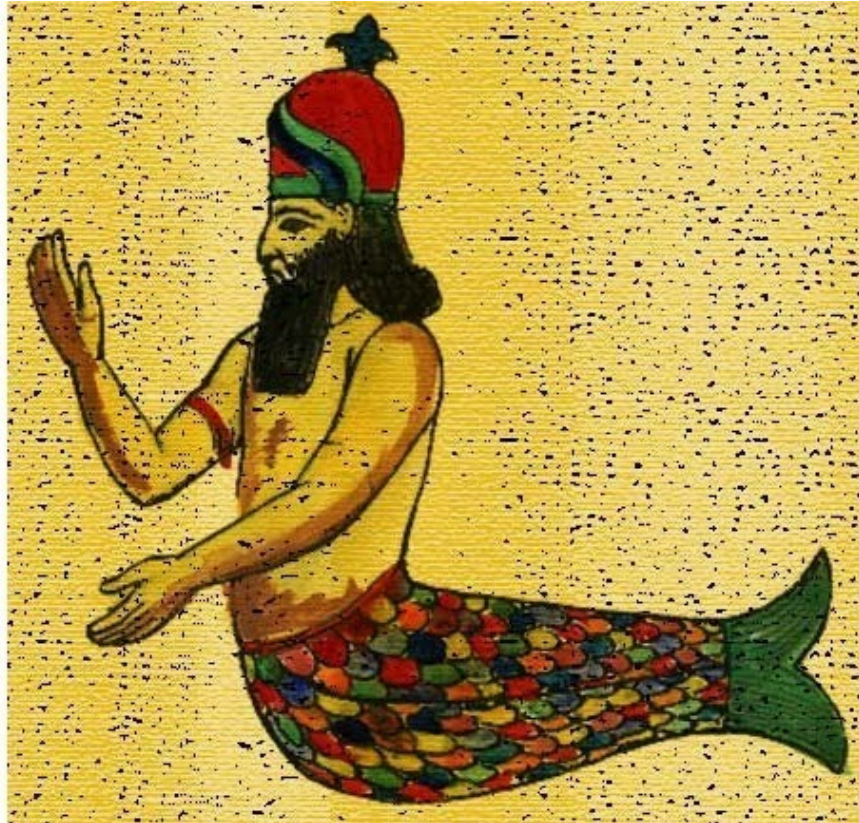
Oannes the merman, ancient picture

to erect temples, to establish laws and to know the geometry bases. He had shown them seeds of the useful plants and has trained them to collect their fruits. In short, this Being had made all required that customs of people became softer and they could lead a civilized lifestyle. And his deeds (acts) were so comprehensive that since then and up to now anything essential had not been invented (devised) any more. After sunset this Being made for sea again and spent all night long in its depths because he was an amphibious.