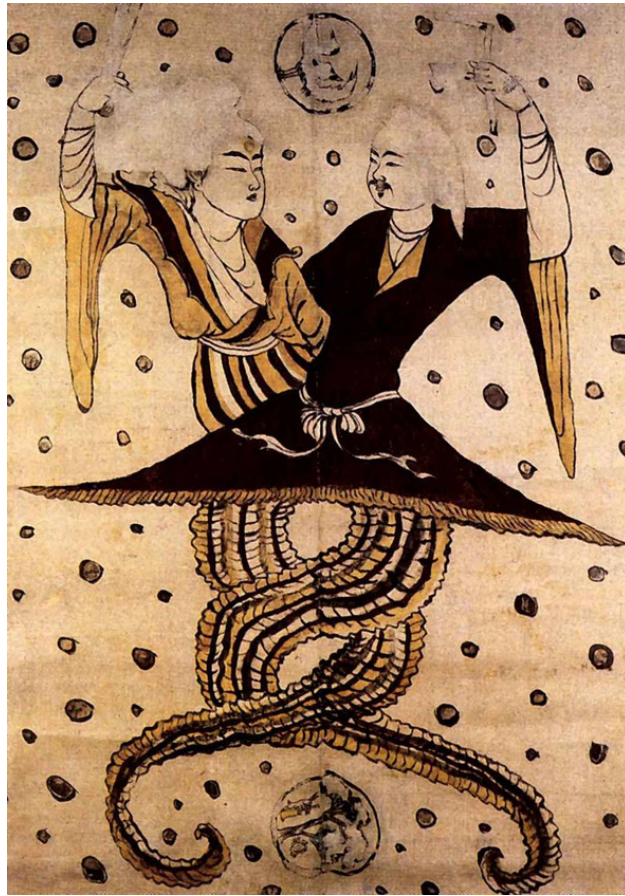
An ancient painting of Nu Wa and Fu Xi.

Also, Chinese believed their ancient civilization was established by an amphibian species with a human head and a tail of a fish or a serpent, which was named FuXi and lived 3000 years B.C. His sister was Nu Wa (Nügua), she had a serpent tail, too.