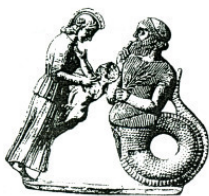
Cecrops the Serpent Tail, the founder of Athens

It is worth noticing here, that the ancient Greek myths mention the multitude of other amphibian personalities with human bodies and fishtails. Those are Nereus, the eldest son of Pontus and Gaia; Poseidon, the Master of the Ocean, and even Cecrops I, the first king of Attica, who established Athens. Cecrops's sons, too, were half-human, half-serpents.