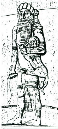
The ancient image of Gilgamesh

Let us again refer to the Epic of Gilgamesh, who was a real person living between the end of XXVII and the beginning of XXVI centuries B.C., the fifth ruler of the Sumerian state capital of Uruk, which is also known from the Bible as Erech.