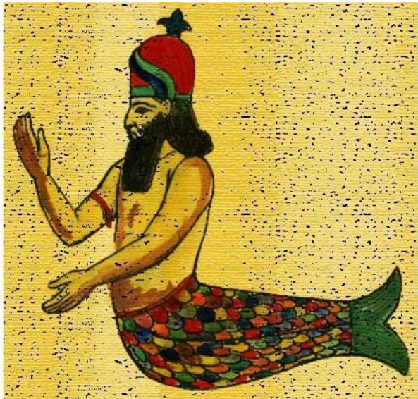
Oannes the merman, ancient picture

comprehensive that since then and up to now anything essential had not been invented (devised) any more. After sunset this Being made for sea again and spent all night long in its depths because he was an amphibious.