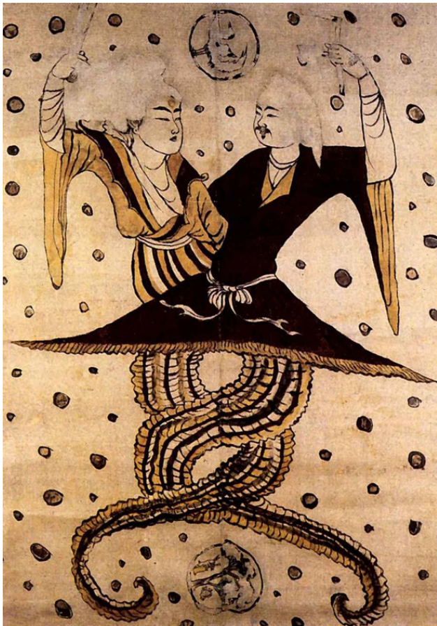
An ancient painting of Nu Wa and Fu Xi.

It is Fu Xi, who is believed to be the author of trigrams and hexagrams from the Book of Changes. Sima Qian, a Chinese