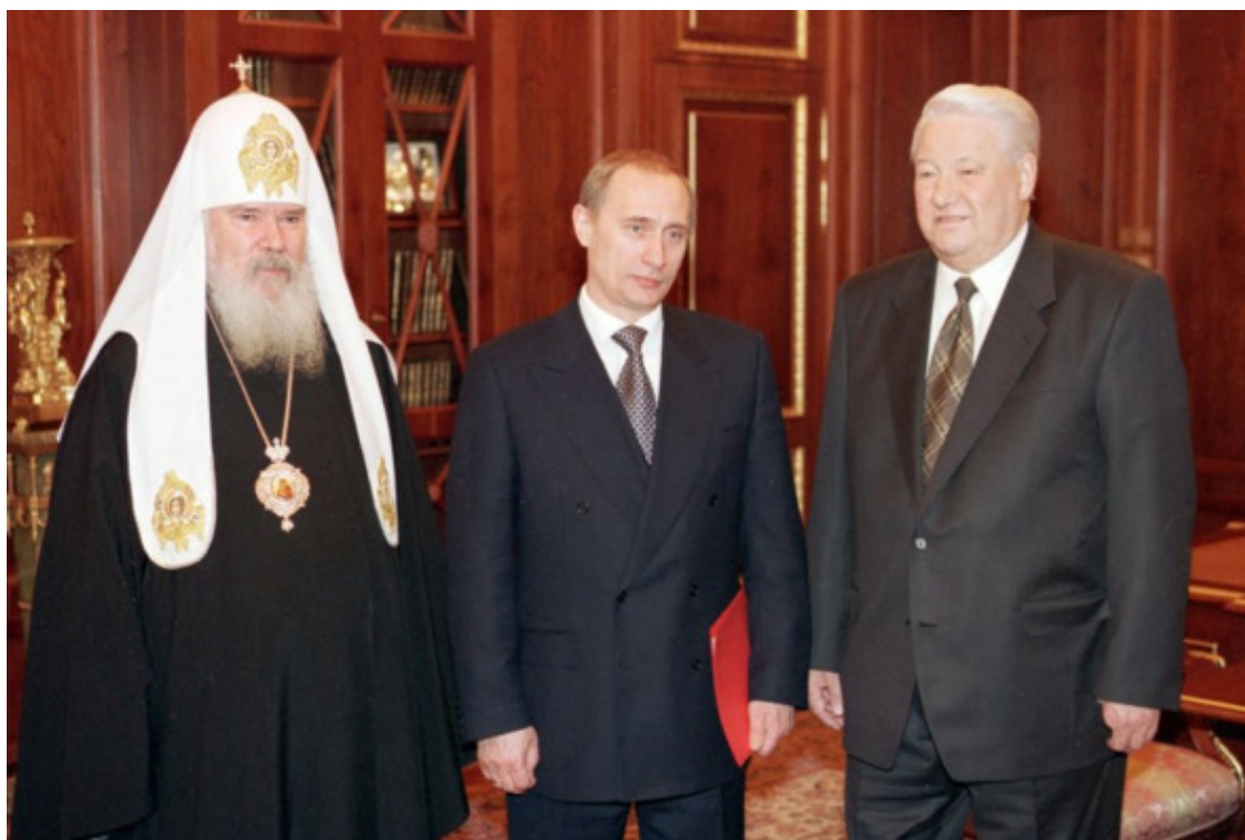
From left to right: 1. Boris Yeltsin 2. Vladimir Putin 3. Alexy the Second, photo 1999

1. Boris Yeltsin. Birth – 1931, with. Bout of the Ural region (as it is quite usual then – in a family repressed and miraculously survived – peasant workers) ... admission to the Ural Polytechnic Institute. S. Kirov... graduation from the university with the qualification “engineer-builder”. Theme of the thesis, if it is, you are interested in the friends – “Television towers”. In the trust “Uraltzhtrubstroy” Boris Nikolayevich works as a joiner, concrete worker, plasterer, crane operator, foreman, foreman, site manager (1957). Since 1966, Yeltsin is the director of the Sverdlovsk House-Building Plant. After passing several more steps of the career ladder, the future President becomes secretary of the Sverdlovsk Regional Committee of the CPSU, responsible for the industrial development of the region, and later the first secretary of this regional committee. The post, approximately equal to the current situation of the governor, B. Yeltsin occupies until 1985. During this time, Boris Nikolaevich differs, in particular, by erecting the highest in the country, marble-covered 23-storey building of the regional committee of the CPSU (nicknamed “Tooth of Wisdom”) and, according to the decision of the Politburo, the demolition of the house of the Ipatievs (the place of execution of the royal family). In general, as an economic manager, B.N.E. shows itself not bad.