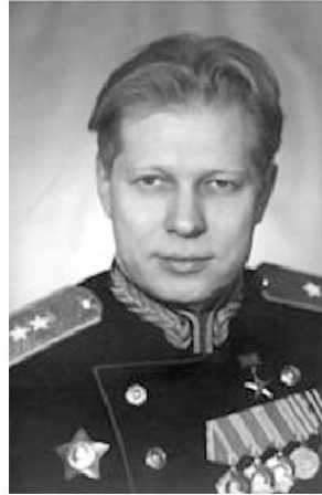
Dmitry Ustinov, photo of the 1950s

Dmitry Ustinov. Birth – 1908, Samara, ... in children's summers – courier work... the introduction of a volunteer in the Red Army, service in Special Purpose Chambers (CHON). Further Ustinov works as a fitter at the factory, he studies at various institutes, down to the Leningrad "Voenmech". Since 1937 (the vacancy field has been cleared) – engineer-designer, director of the plant "Bolshevik". In 1941, 33-year-old Dmitry Fedorovich became a People's Commissar of Soviet armament. His predecessor, B. Vannikov, Stalin must be released a month after the outbreak of the war – since it is too necessary for the production of ammunition. The recent prisoner becomes deputy commissar-beginner. Since 1946 Dmitry Ustinov, the USSR Minister of Armaments, has been actively participating in the missile project. In 1957, D.W. advocates N. Khrushchev, in 1964 – promotes his displacement. Since 1976, Ustinov – one of the secretaries of the CPSU Central Committee, which is included in the unofficial, so-called. "A small Politburo", as well as the Minister of Defense. He died in 1984, from severe pneumonia; caused by the reluctance of Dmitry Fedorovich to leave, an official event held in the cold wind. It suggests that almost simultaneously with D. Ustinov, and with the same clinical picture of the disease, the defense ministers of the GDR, Hungary and Czechoslovakia die, who were together at a festive dinner (in honor of the completion of the Warsaw Pact exercises).