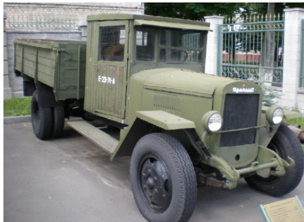
ZIS-5, the legendary domestic truck

Ivan Likhachev. Birth – 1896, with. Ozers of the Tula region... The end of the village school, work as a mechanic at the Putilov factory... during the First World War – a service by a sailor in the Baltic Fleet. From 1917 to 1921 years. Likhachev is a commander in parts of the Red Army, and even an employee of the Cheka. Further – studying at the Mining Academy and the Leningrad Electromechanical Institute. Getting too many, not always applicable in practice, knowledge will upset the future People’s Commissar. He leaves the university and, at the behest of the Communist Party, heads the Moscow Automobile Plant (1926). The plant was founded in 1916, before the final establishment of the Soviet government, it was able to produce about 1,300 Fiat cars. The first