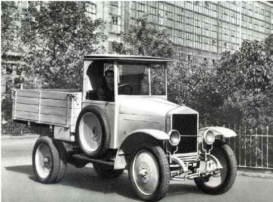
The very first Soviet truck