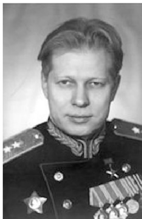
Dmitry Ustinov, photo of the 1950s