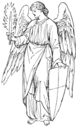
Angel crest of Tuite, Bart. co. Tip.

Josephus, the more effectually to excite respect for the great Hebrew symbol in the minds of his readers, purposely throws over it the veil of obscurity. He says: "The cherubim are winged creatures, but the form of them does not resemble that of any living creature seen by man." In the works of Philo Judæus there is an express dissertation upon the cherubim. The learned Brochart and many others have attempted to elucidate the subject to little purpose. The ambiguity which always accompanies a written description of objects with which we are imperfectly acquainted applies with greater force to this mysterious being combining so many apparently conflicting attributes.