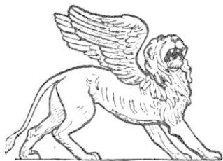
The Lion of St. Mark, Venice.