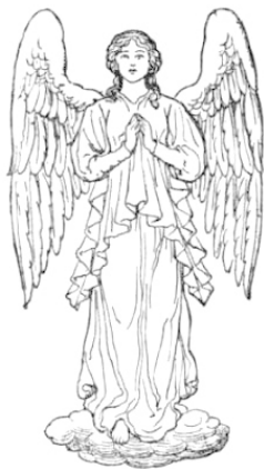
Angel with Cloud Symbol.

“The modern taste,” says the same writer, “for giving angels pure white vesture does not appear to be derived from the Middle Ages, and certainly not from the best period when angels were clad in every brilliant colour, as a beautiful example at St. Michael’s, York, shows. Here an angel swinging a golden censer has a green tunic covered with a white cloak or mantle. The nimbus is bright blue, and the wings have the upper parts yellow, and are tipped with green. At Goodnestowe church, St. Michael has a deep crimson tunic, a white mantle edged with a rich gold border, green wings, and a light crimson nimbus,” and mention is here made of the white vesture of the angel at the Sepulchre, and that nowhere else does the Gospel mention any angel clad in white but in the narratives of Our Lord’s resurrection.