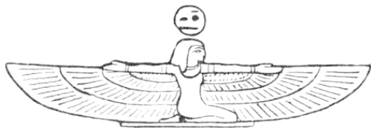
Egyptian Winged Deity.

In all ages civilised man has thought of them and represented them in art as of form like to his own, and with attributes of volition and power suggested by wings. Scripture itself justifies the similitude; the Almighty is sublimely represented as “walking upon the wings of the wind.” Wings have always been the symbol or attribute of volition , of mind , or of the spirit or air . No apter emblem could be found for a rapid and resistless element than birds or the wings of birds; and however incongruous such appendages may be, and anatomically impossible, it is figuratively as the messengers of God’s will to man that we have come to view these celestial habitants.