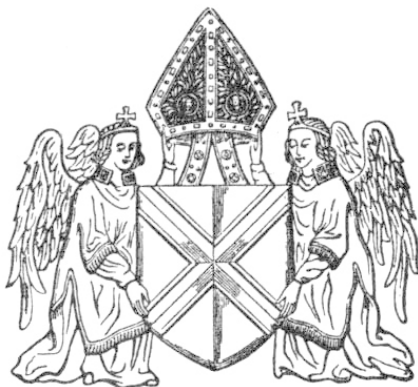
Arms of the Abbey of St. Albans.

intended to denote his claim to the crown of France, being the supporters of the Royal arms of that kingdom. Upon his Great Seal other supporters are used. There are also instances of the shield of Henry VI. being supported by angels, but they are by some authorities considered as purely religious symbols rather than heraldic.