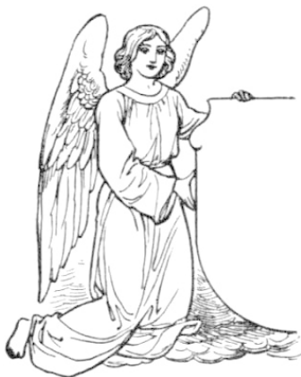
Kneeling Angel Supporter.

esteem and honour in which armorial insignia were held by our ancestors in those ages.” And reference is made to examples sculptured in the noble timber roof of Westminster Hall and elsewhere. As an example we give the shield of arms of the Abbey of St. Albans.