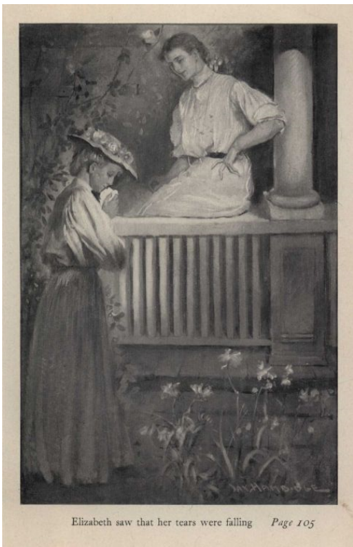
Elizabeth saw that her tears were falling Page 105

Elizabeth saw that her tears were falling