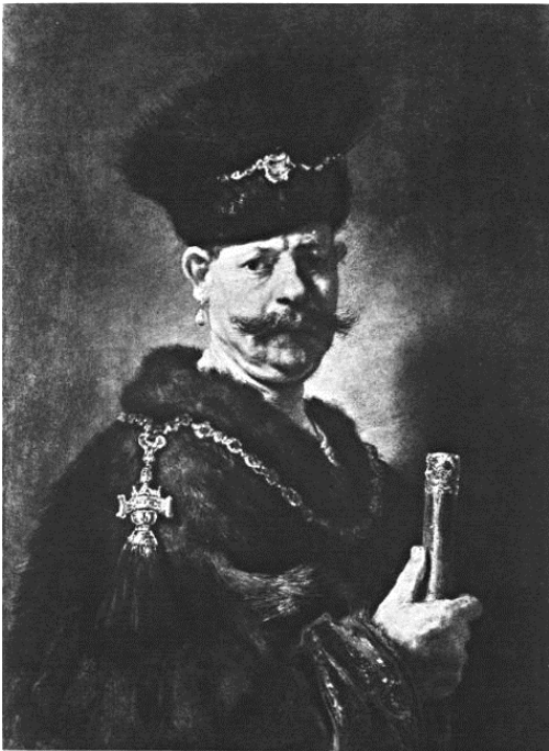
IN THE HERMITAGE, PETROGRAD SOBIESKI – Portrait by Rembrandt