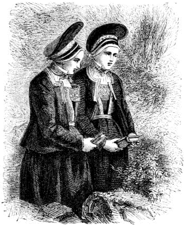
4. – WOMEN OF STAVANGER, NORWAY.