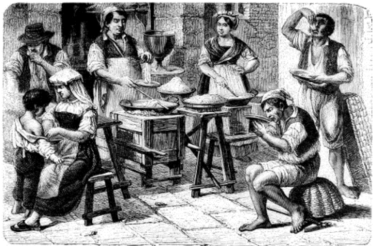
32. – A MACARONI SHOP AT NAPLES.

The most favourable time for examining the great variety of types which unite in the population of Southern Italy, is on the occasion of the public festivals which are so numerous at Naples. This curious mixture may be investigated in the crowds of people who frequent the festival of Piedigrotta, where are to be found examples of every Greek and Latin race.