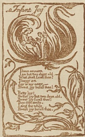
From Blake's "Songs of Innocence."

The Lamb. Infant Joy. From Blake's "Songs of Innocence."