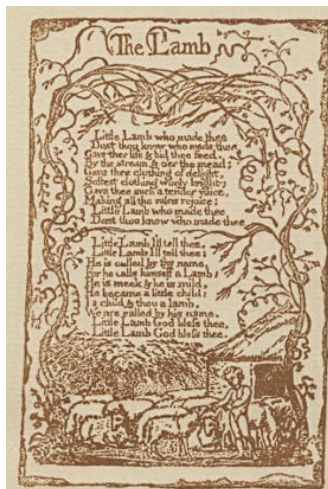
From Blake's "Songs of Innocence."

needed; and also to help in tinting them from his drawings with right artistic feeling; in all of which tasks she, to her honour, much delighted. The size of the plates was small, for the sake of economising copper, something under five inches by three. The number of engraved pages in the Songs of Innocence alone was twenty-seven. They were done up in boards by Mrs. Blake's hand, forming a small octavo; so that the poet and his wife did everything in making the book, writing, designing, printing, engraving, – everything except manufacturing the paper; the very ink, or colour rather, they did make. Never before, surely, was a man so literally the author of his own book."