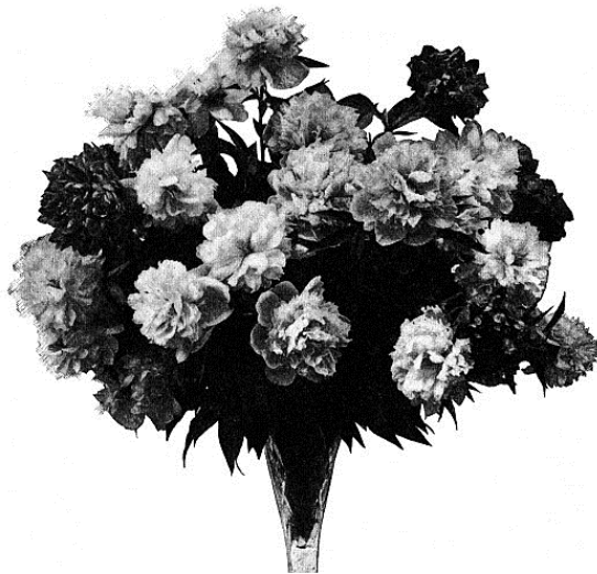
Vase of Peonies June sixth

One should begin with a few plants – perhaps a dozen only – and the “trouble” will soon become a delight, unless one is devoid of all love for flowers.