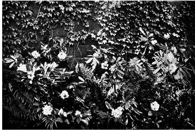
Rhododendron maximum and Ferns along north side of house, with Ampelopsis Veitchii July fourth

What is beautiful in one place becomes incongruous and ridiculous in another. Not long ago, a woman making an afternoon visit asked me to show her the gardens. Daintily balancing herself upon slippers with the highest possible heels, clad in a costume appropriate only for a fête at Newport, she strolled about. She thought it all “quite lovely” and “really, very nice,” but, at least ten times, while making the tour, wondered “Why in the world don’t you have an Italian garden?” No explanation of the lack of taste that such a garden would indicate in connection with the house, had any effect. The simple, formal gardens of a hundred years ago, with Box-edged paths, borders and regular Box-edged beds, are always beautiful, never become tiresome, and have the additional merit of being appropriate either to the fine country-place or the simple cottage.