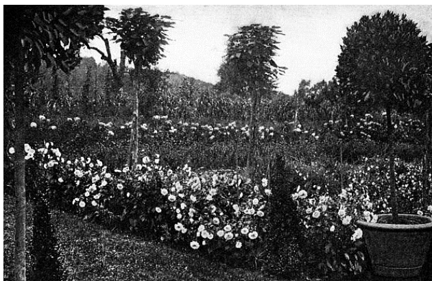
Asters blooming in a border September fifteenth