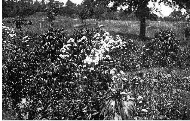
A clump of Valerian June sixth