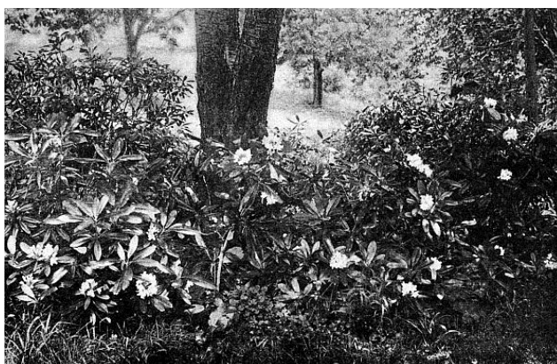
Rhododendron maximum under a Cherry tree July fourth

In front of these plant ferns of all kinds from the woods, and edge the border with Columbines. If these Rhododendrons do not grow in your vicinity, they can be ordered from a florist. In the hills, about five miles from us, acres of them grow wild, and twice a year I send my men with wagons to dig them up. They stand transplanting perfectly if care is taken to get all the roots, which is not difficult, as they do not grow deep. Keep them quite wet for a week after planting, and never let them get very dry. A good plan is to mulch them in early June to the depth of six inches or more with the clippings of the lawn grass, or with old manure. When once well rooted, the Rhododendrons will last a lifetime. They seem to bear transplanting at any season. Some think they do best if taken when in full bloom. I have always done this in April or late October, and, of a wagon-load transplanted last October, all have lived. Many of these were like trees, quite eight feet tall and too large to be satisfactory about the house, so they were set among the evergreens in a shrubbery.