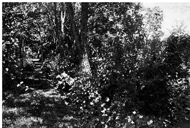
A shady garden walk May thirty-first

I have no glass on my place, not even a cold-frame or hot-bed. Everything is raised in the open ground, except the few bedding plants mentioned whose roots are stored through the winter. Therefore, mine can truly be called a hardy garden, and is the only one I know at all approaching it in size and quantity of flowers raised, where similar conditions exist.