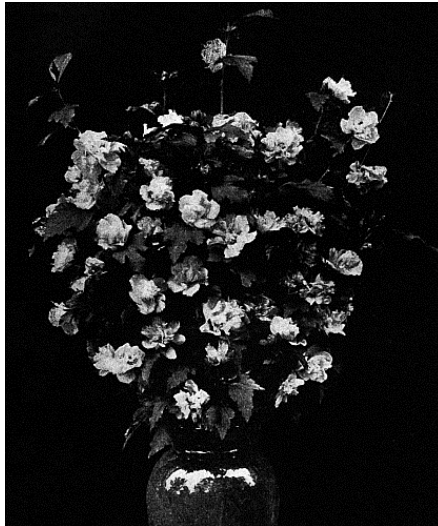
Vase of Altheas September sixteenth

It will be seen that the next places to plant are along the boundary lines of the property. Even if one side only be laid out at a time, a large number of plants will be required. The owner will find great pleasure in raising as many of these herself as possible. To accomplish this, somewhere at the back of the place, a seed-bed should be made, and in April the seeds of perennials and annuals sown. The border must be made by September the twentieth and should be at least four feet wide. Either a hedge can be placed at the back of the border, or tall-growing flowering shrubs, such as white and purple Lilacs (not the Persian), Mock Oranges (Syringa), Deutzia and Roses of Sharon (Althea). These shrubs will grow about equally high, yield an abundance of flowers, the Altheas in August, the others in May or June, and in four or five years will form a complete screen from the neighboring grounds.