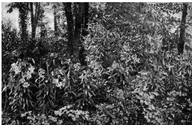
Lilium speciosum rubrum