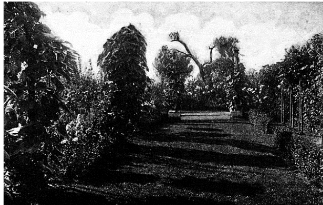
Broad grass walk August twenty-fifth

Love of flowers and all things green and growing is with many men and women a passion so strong that it often seems to be a sort of primal instinct, coming down through generation after generation, from the first man who was put into a garden “to dress it and to keep it.” People whose lives, and those of their parents before them, have been spent in dingy tenements, and whose only garden is a rickety soap-box high up on a fire-escape, share this love, which must have a plant to tend, with those whose gardens cover acres and whose plants have been gathered from all the countries of the world. How often in summer, when called to town, and when driving through the squalid streets to the ferries or riding on the elevated road, one sees these gardens of the poor. Sometimes they are only a Geranium or two, or the gay Petunia. Often a tall Sunflower, or a Tomato plant red with fruit. These efforts tell of the love for the growing things, and of the care that makes them live and blossom against all odds. One feels a thrill of sympathy with the owners of the plants, and wishes that some day their lot may be cast in happier places, where they too may have gardens to tend.