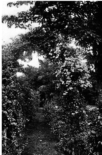
Arch over rose-walk, covered with Golden Honeysuckle and Clematis paniculata September fifteenth

Among the creepers are the Crimson Rambler Rose and the Honeysuckle. In three years the Roses have grown above the second-story windows.