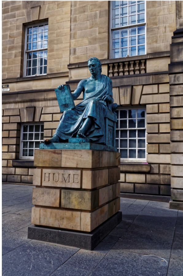
A statue of Hume in Edinburgh.

Humorosophy – the direction in philosophy, that analyzes two objects in the same time or same theme: Humor and Hume.