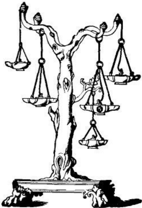
Bronze lampholder: Five lamps hung from the branches of this bronze tree. It was twenty inches high.