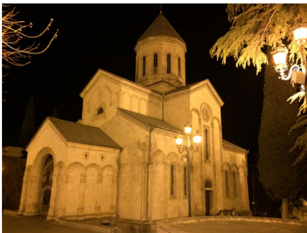
Keshwati Temple in Tbilisi. 1910