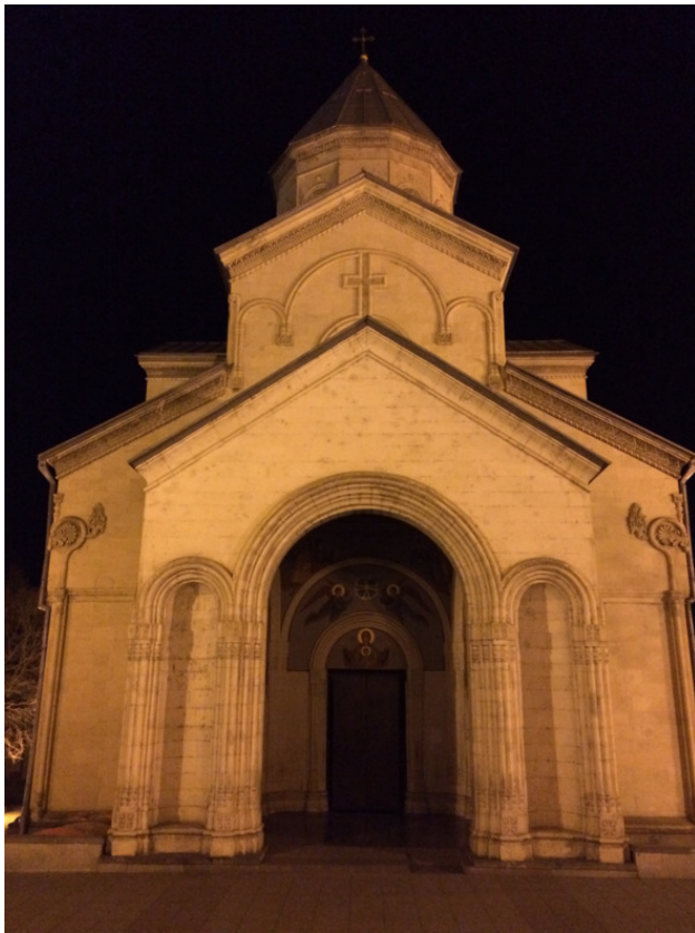
Keshwati Temple in Tbilisi. 1910

After the October Revolution, on May 26, 1918, Georgia declared itself an independent state, which was abbreviated by analogy with the future socialist Germany, the GDR, the