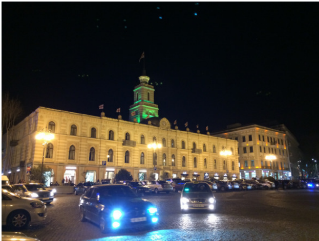
Tbilisi City Hall. 1840-ies.

In 1840, Tbilisi became the center of the Transcaucasian region. Polukis high administrative status, the city began to develop rapidly on the basis of a mixture of Russian culture and cultures of the peoples of the Caucasus. Here, markets, squares, fountains, apartment houses and public buildings were built. Many of them are an important part of the historical and cultural heritage of Tbilisi and to this day.