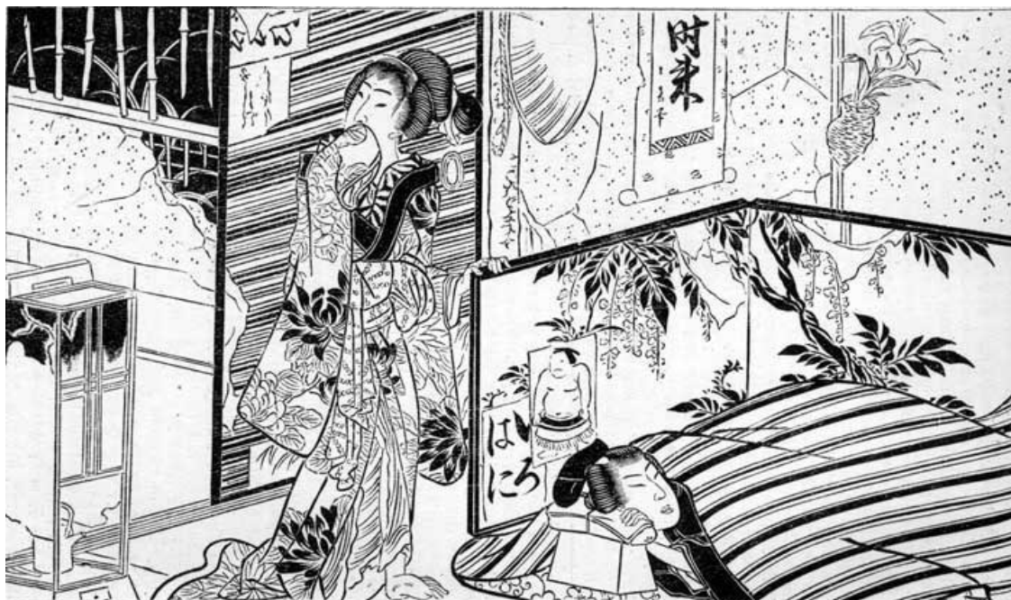
GOMPACHI AWAKENED BY THE MAIDEN IN THE ROBBERS' DEN.

But alas for the grief of the maiden, who sat sobbing her heart out and mourning over her lover's departure! He, all the while thinking more of ambition than of love, went to her and comforted her, and said: "Dry your eyes, sweetheart, and weep no more, for I shall soon come back to you. Do you, in the meanwhile, be faithful and true to me, and tend your parents with filial piety."