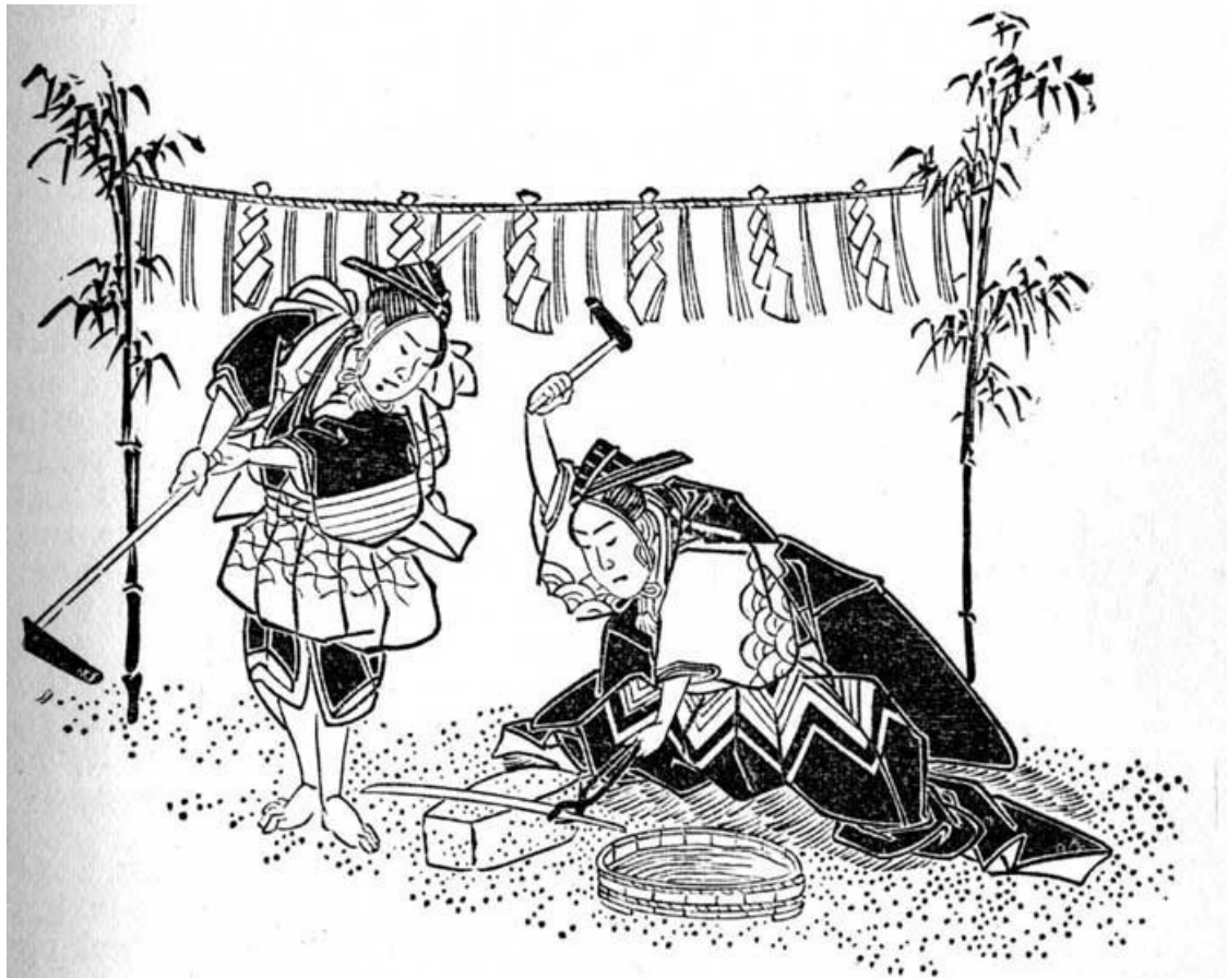
FORGING THE SWORD.

The trenchant edge of the Japanese sword is notorious. It is said that the best blades will in the hands of an expert swordsman cut through the dead bodies of three men, laid one upon the other, at a blow. The swords of the Shogun used to be tried upon the corpses of executed criminals; the public headsman was entrusted with the duty, and for a "nose medicine," or bribe of two bus (about three shillings), would substitute the weapon of a private individual for that of his Lord. Dogs and beggars, lying helpless by the roadside, not unfrequently serve to test a ruffian's sword; but the executioner earns many a fee from those who wish to see how their blades will cut off a head.