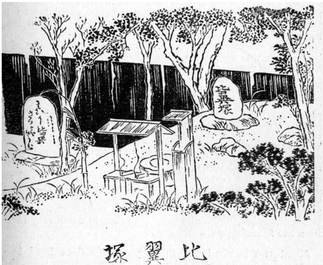
THE TOMB OF THE SHIYOKU.

But of all the marvellous customs that I wot of in connection with Japanese religious exercises, none appears to me so strange as that of spitting at the images of the gods, more especially at the statues of the Ni-ô, the two huge red or red and green statues which, like Gog and Magog, emblems of strength, stand as guardians of the chief Buddhist temples. The figures are protected by a network of iron wire, through which the votaries, praying the while, spit pieces of paper, which they had chewed up into a pulp. If the pellet sticks to the statue, the omen is favourable; if it falls, the prayer is not accepted. The inside of the great bell at the Tycoon's burial-ground, and almost every holy statue throughout the country, are all covered with these outspittings from pious mouths. 11