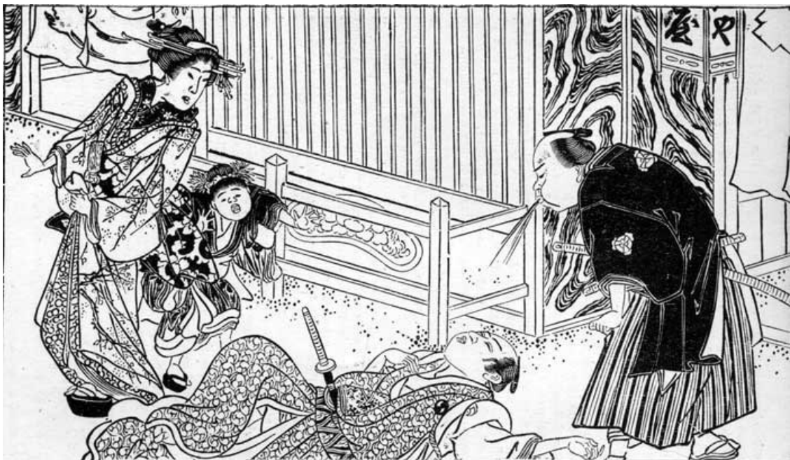
THE SATSUMA MAN INSULTS OISHI KURANOSUKÉ.