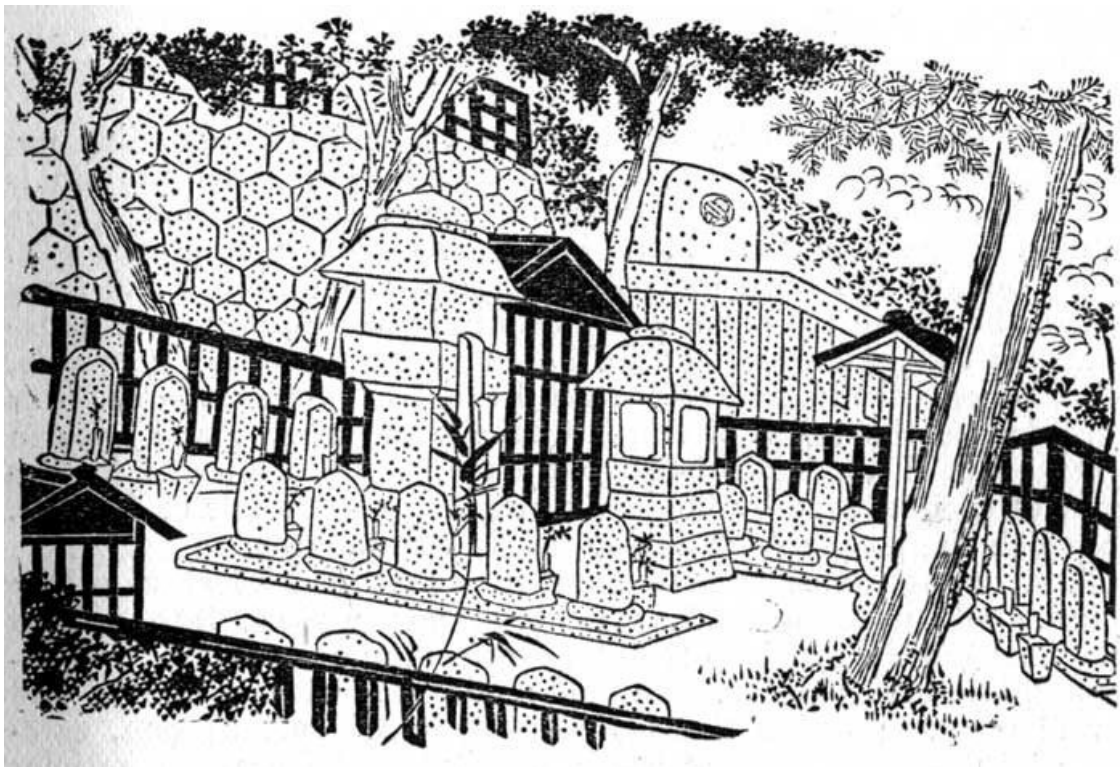
THE TOMBS OF THE RÔNINS.

At last they were summoned to the Supreme Court, where the governors of Yedo and the public censors had assembled; and the sentence passed upon them was as follows: "Whereas, neither respecting the dignity of the city nor fearing the Government, having leagued yourselves together to slay your enemy, you violently broke into the house of Kira Kôtsuké no Suké by night and murdered him, the sentence of the Court is, that, for this audacious conduct, you perform hara-kiri ." When the sentence had been read, the forty-seven Rônins were divided into four parties, and handed over to the safe keeping of four different daimios; and sheriffs were sent to the palaces of those daimios in whose presence the Rônins were made to perform hara-kiri . But, as from the very beginning they had all made up their minds that to this end they must come, they met their death nobly; and their corpses were carried to Sengakuji, and buried in front of the tomb of their master, Asano Takumi no Kami. And when the fame of this became noised abroad, the people flocked to pray at the graves of these faithful men.