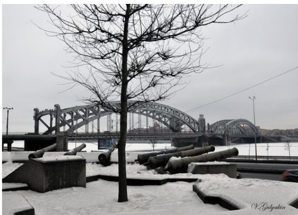
Symbolical reconstruction of fortress Nienschanz

Rainy October, 1702. Troops of the associate and the friend Peter I, the general field marshal Boris Sheremetev take storm the Swedish fortress Noteburg. Pyotr participates in this nice business! No, not in the Commander-in-chief rank – save, God! – and only goal-scorer captain: he has no need “to be stuck out”, he and so – Pyotr The Great! This fortress, having a reputation for unapproachable hitherto, costs on the island in the mouth of the Neva River and, together with other fortress, – Nienschanz, – that is lower on a current, controls, and, speaking simply, – tightly bars for Russians all waterway from Lake Ladoga to the Baltic Sea. In half a year, at the beginning of May, 1703, the Nienschanz is given. Without fight.