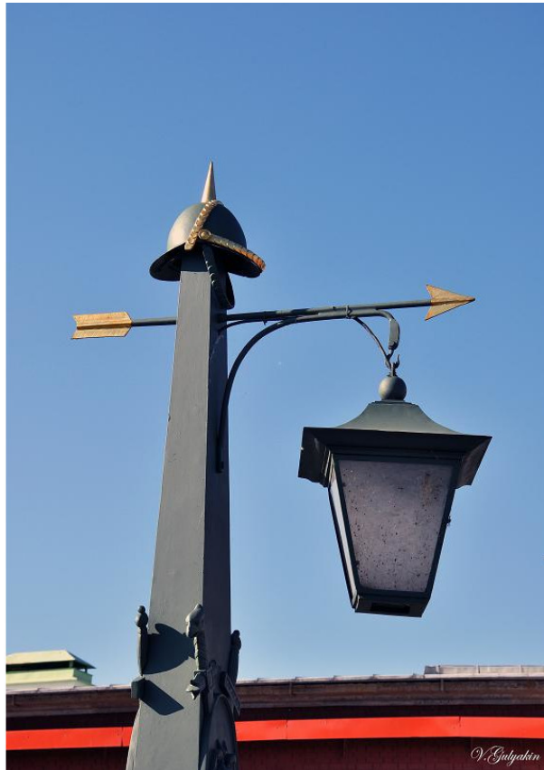
Lamps and fragments of a decor of a protective lattice of Ioannovsky Bridge

A little more than 150 meters long and 10 meters wide, the bridge does not suppress the sizes, but its wooden flooring which is boomingly “giving” steps, a decor of a protective lattice with “semi-antique” lamps... Yes, link of times is felt here – mighty well!