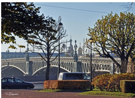
Trinity Bridge. View from the right coast of Neva

And so far we will look once more at our handsome, – at Trinity Bridge.