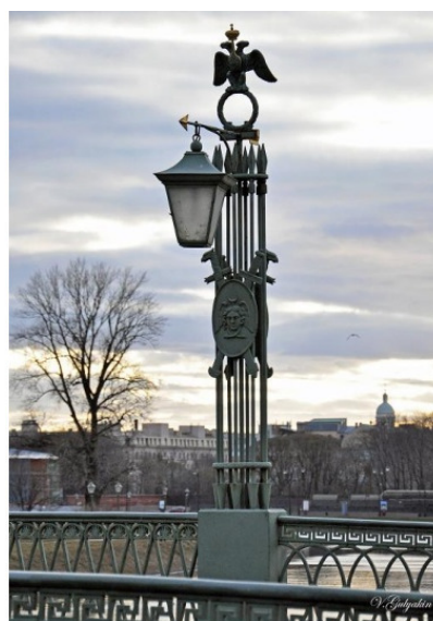
Yes, link of times is felt here...