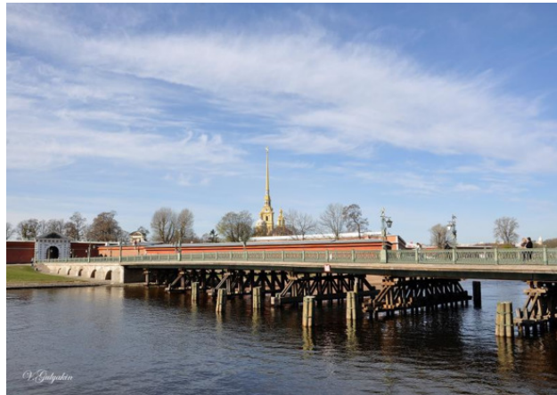
Ioannovsky Bridge through the Kronverksky passage (through that to a channel)