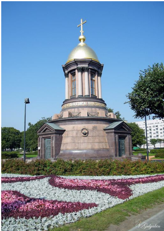
One more type of the Chapel of the Trinity