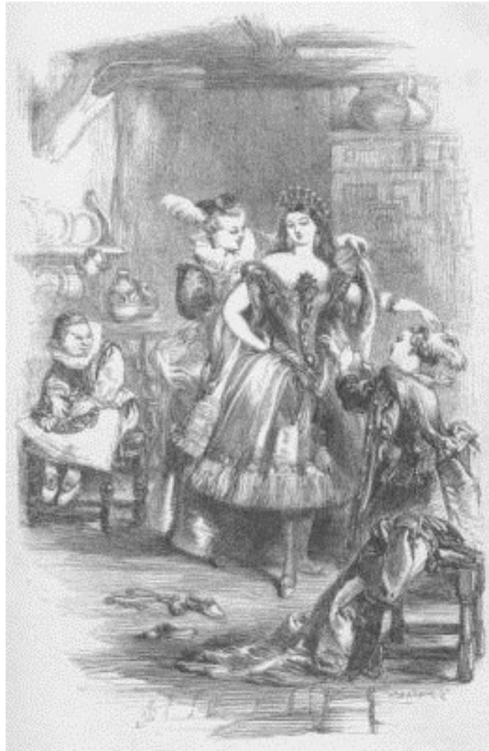
The May Queen.

"Weel, sister Alizon, ye may a farrently May Queen, ey mun say" she observed, spitefully, "but to my mind other Suky Worseley, or Nancy Holt, here, would ha' looked prottier."