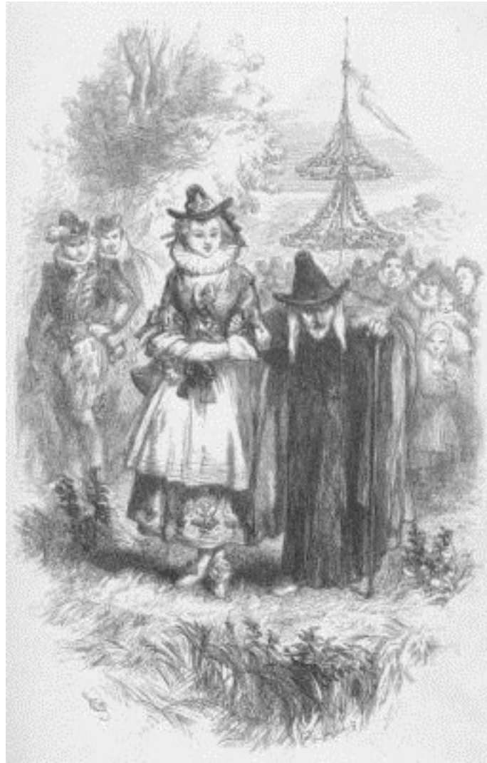
Nan Redferne and Mother Chattox.

"Master Richard Assheton, o' Middleton," whispered Nan Redferne.