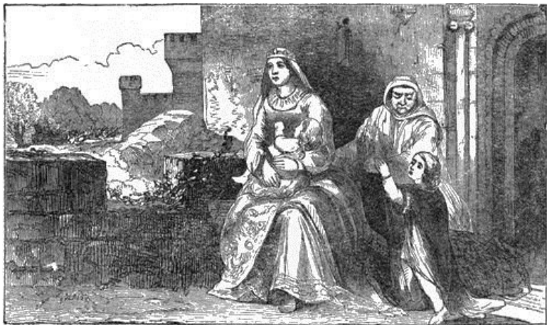
Distress of Margaret's Mother.

There was a great deal of sympathy felt for Isabella in her distress by all the people of Nancy. She was very young and very beautiful. Her children, and especially Margaret, were very beautiful too, and this greatly increased the compassion which the people were disposed to feel for her. Isabella's mother was strongly inclined to make new efforts to raise an army, in order to meet and fight Antoine again; but Isabella herself, who was now more concerned for the safety of her husband than for the recovery of her dominions, was disposed to pursue a conciliatory course. So she sent word to her uncle that she wished to see him,