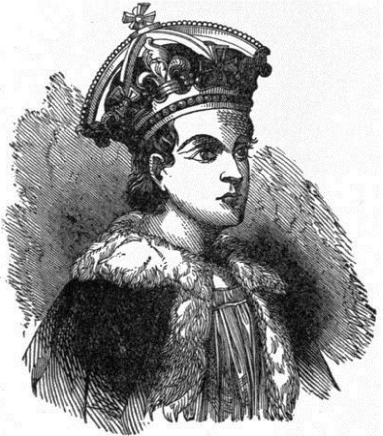
Henry VI. in his Youth.

Henry was quite young at the time of his coronations. He was a very pretty boy, and his countenance wore a mild and gentle