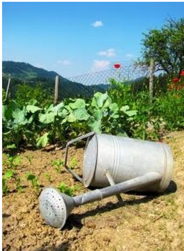
Chapter 2: Container Gardening

Home gardening shouldn't make anyone get anxious. On the off chance that you do choose to take a stab at homing cultivating and find that you don't have a green thumb, don't get debilitated. Endeavor it again the following gardening season.