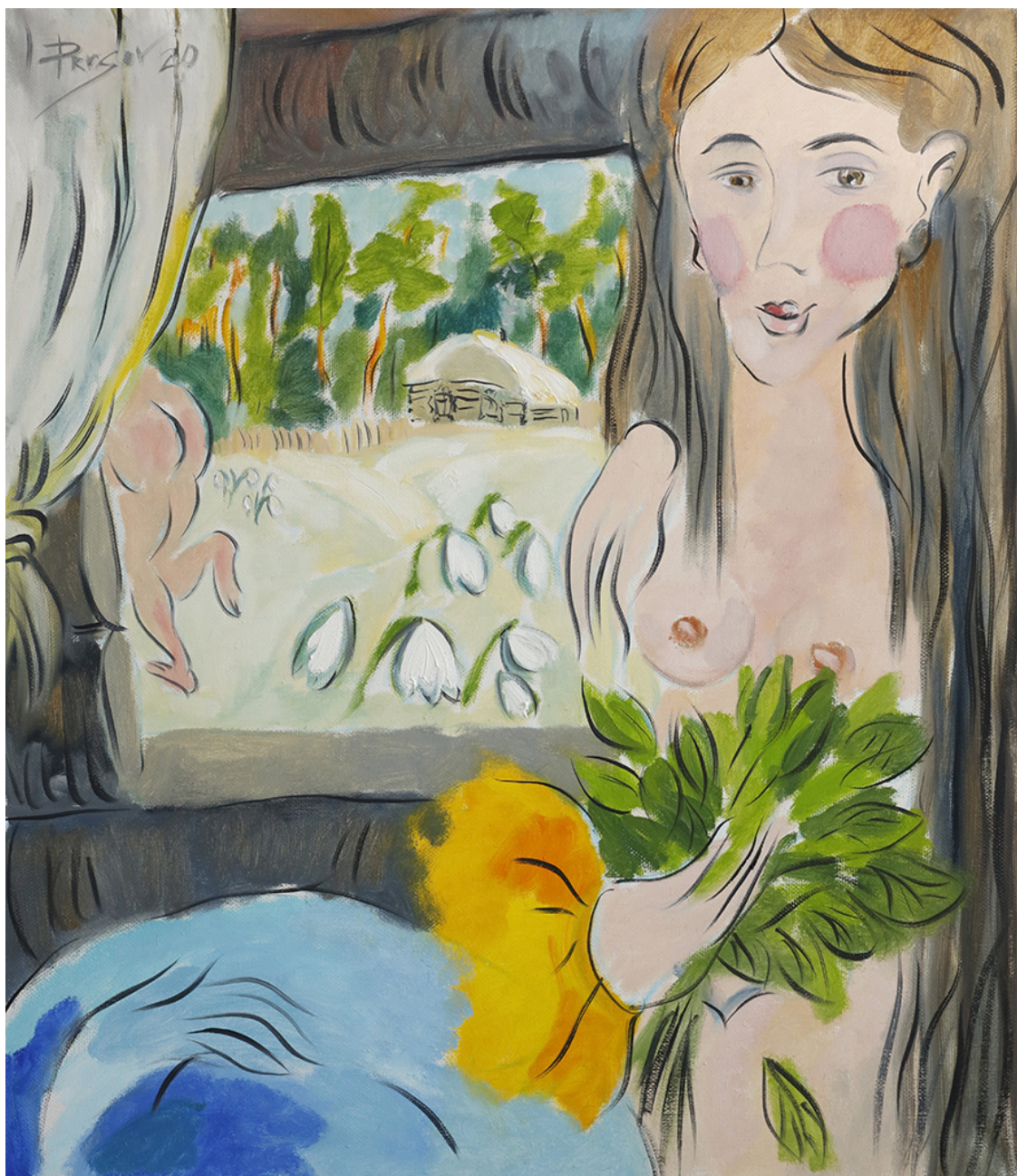
Marfa in a bathhouse. 2020. Canvas, oil. 80x70 cm