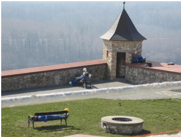
Men at work.