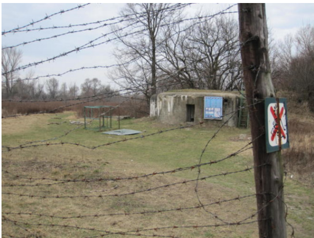
The iron curtain.