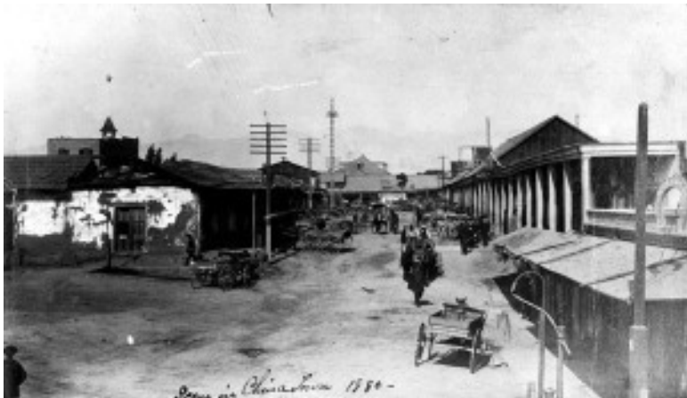
Scene in Chinatown 1880 -

Figure 7 - Calle De Los Negros , 1880. Until 1882, The District Remained Unaltered. Then, Some Of The Buildings Were Demolished.