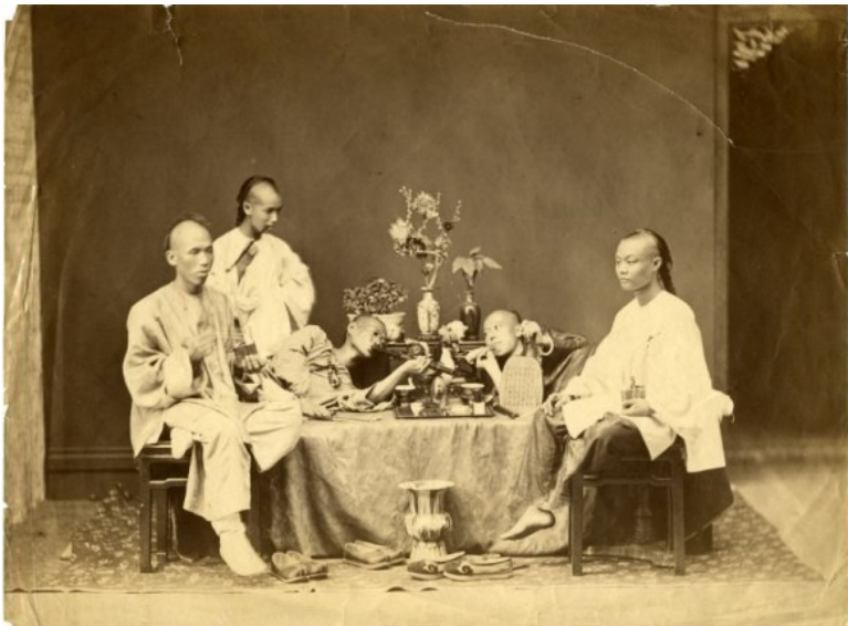
Figure 9 - An Opium Den, 1890. Opium, In China, was Used For Therapeutic And Religious Purposes. It Was Only After The Fall Of The Qing Empire And The Anglo-Chinese Wars That It Was Deliberately Distributed By English Among Chinese. The Reason was, Mainly, To Increase The Monopoly. Field Were Needed For It, Field That Were Used For Agriculture And Sustainment. China, Of Course, Tried To Stop This Madness. To No Avail. Such Vice And The Trade That Followed Were Approved -And Managed- By Both The Triad And The US Government.

Apparently, Chinese plunged the city into depravity. They