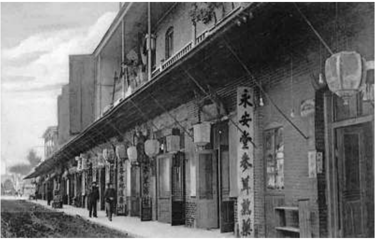
Figure 8 - Chinatown, 1870. Tea Houses, Stores, And Brothels Made It Into A Little San Francisco.