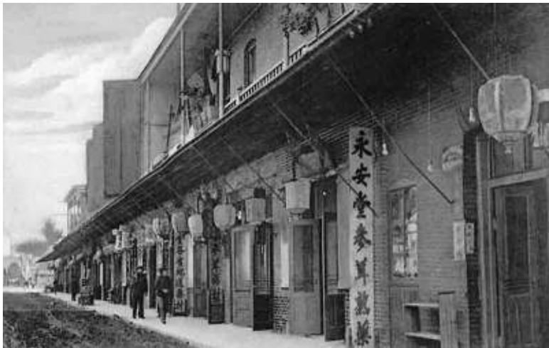
Figure 5 - San Francisco's Chinatown, 1906.

One could talk hours about the difference between intelligence and cunning, without ever coming to terms with it. The truth is simple. Some misconduct, producing a temporary advantage, is -over time- harmful and detrimental. Selfishness and lack of empathy cause an inevitable damage. If the victim is not prone to forgiveness, the echo of it will widen immeasurably and with certain destructive results. Simply put, an action leads to a reaction. That was the relationship between Uncle Sam and Chinese. That is why the whole New Continent cried out to the Yellow Peril.