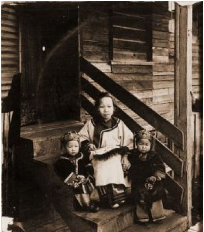
Figure 6 – Young Mother And Her Two children.