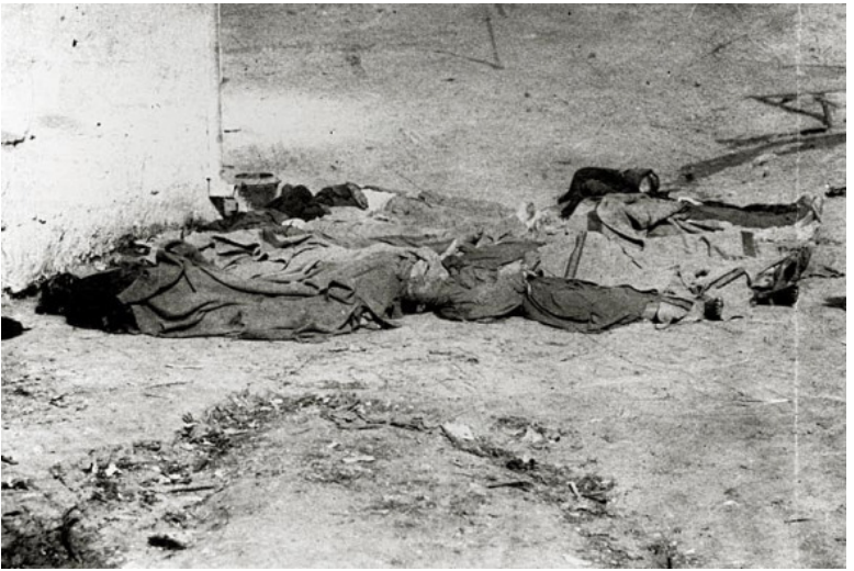
Figure 11 - The Chinese Massacre, 1871. There Were Nineteen -Official- Victims. The Entire Area Was Looted And Burned. The Injured Were Countless.