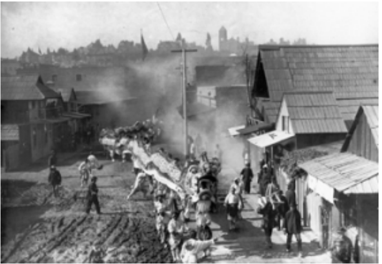
Figure 4 - Chinatown, 1860. A Few Wooden Houses And Some stores. In Thirty Years, It Thrived And Became The Core Of American Economy. Not To Mention, The Favourite Option Of The Rich And Famous' Night Life.

The country, due to the Civil War, was experiencing a difficult historical situation. The economic destabilization of the South, the alternating political trends, the hunger for change, the eagerness to dominate Europe produced a devastating knock-on effect . A large part of the population had suffered negatively from the consequences of the Restoration Of The System . Thousands were doomed. Children starved. Traders bankrupted