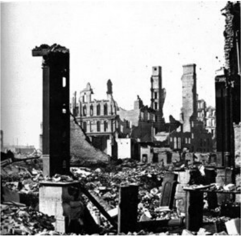
Figure 14 – John Chapin’s Great Chicago Fire. $222 Million, 17,500 Buildings Destroyed, 300 Deaths.

The fire in Chicago on the 8 th of October, 1871, was the final act. It registered three hundred victims, one hundred and ten thousand homeless people, and eighteen thousand houses destroyed by the fire. One single wall survived. The ensuing