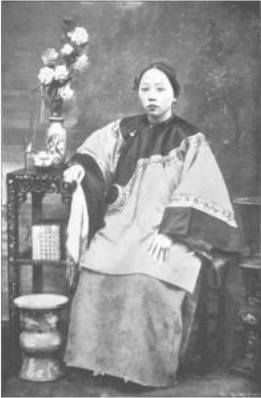
Figure 3 – Young Woman In Traditional Hong Kong Clothes, 1860.

nobody had anything to say. They could have slaughter each other and employers could care less. After all, they were perfectly replaceable.