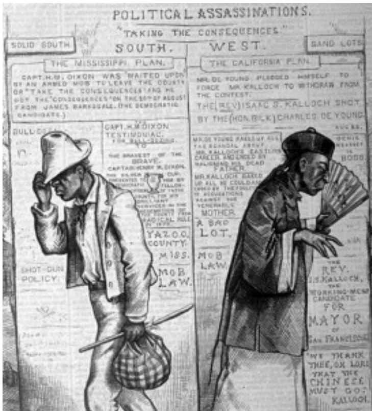
Figure 13 – Thomas Nast’s Illustration “Go West – Go East” Exposing Jim Crow Laws. The Father Of The American Cartoon Openly Criticized American Political System In The Magazine, Harper’s Weekly.

Trusting in the innate racism of Americans, the Government