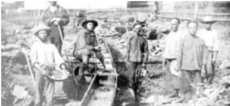
Figure 1 - Chinese Labourers On The North Railroads, 1850

Myriads of Chinese immigrants, starting 1848, worked on the transcontinental railroads. They were labourers , farmers who wanted to escape plagues and hunger, and their salaries were close to nothing. Far from home, they barely survive. Close to starvation, sleeping in the open. All in order to grab those few cents for their families.