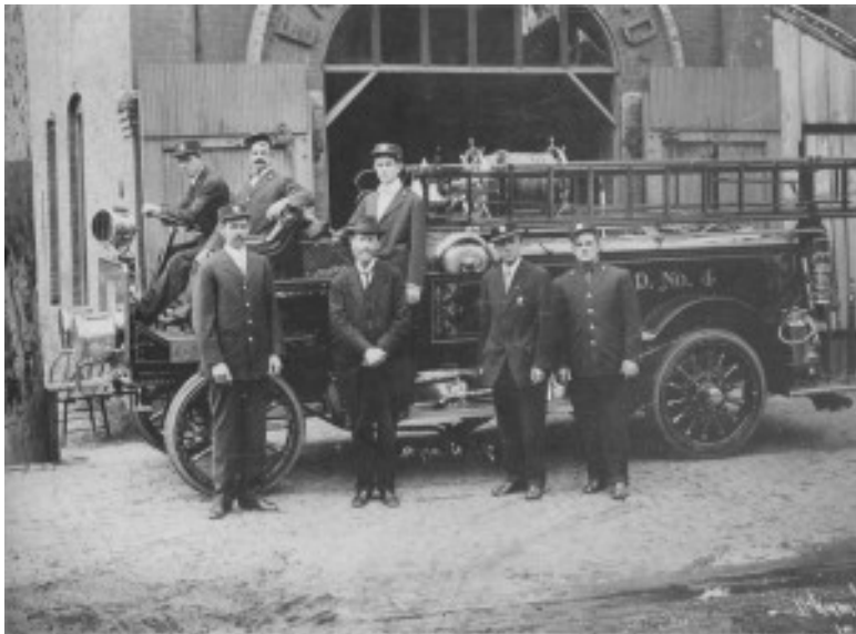
Figure 15 - Chicago Fire Department, 1871. Although Equipped With Very Modern And Advanced Machineries, Bizarre And Deadly Mistakes Were Made During That Infamous Event.

Someone said that even Frederick Law Olmsted despised Chicago, particularly its immigrants and ugly buildings. Furthermore, in comparison to the rest of the United States, the city was far behind in terms of industrialization.