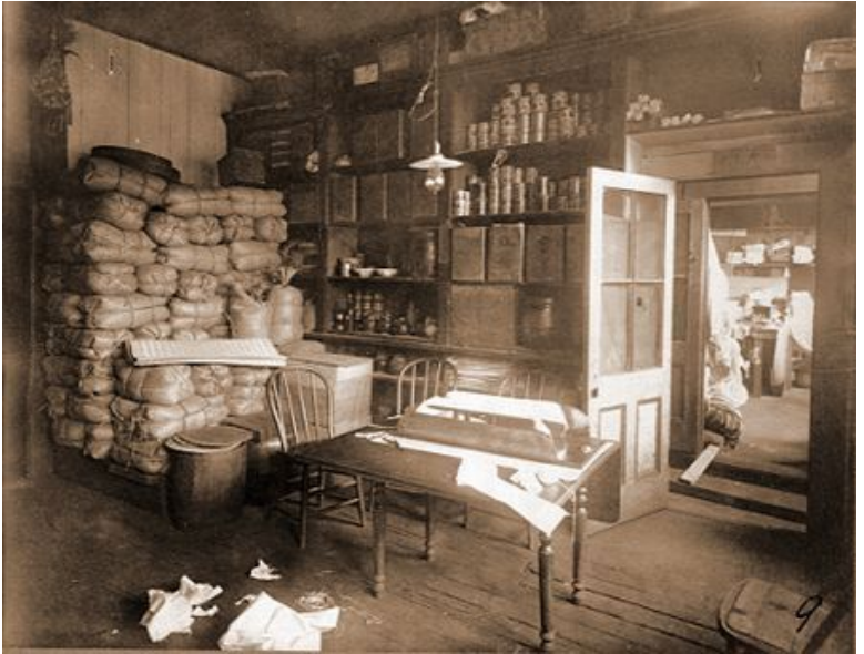
Figure 10 - Back Of A Store In Chinatown, 1880. American Police Has Always Had Close And Ambiguous Liasons With The Triad. An Exclusive Control Was Exercised Not Only On Opium And Spices, But Also On Labourers And Commodities (Both Official And Illegal) That Were Imported At Very Low Cost. It Obviously Affected The Economy, Which Collapsed Soon After. Entrepreneurs, Especially Those Who Dealt Whith Railroads That Received Huge Government Subsidies, Were

Gotta-Behave. But that is another story and shall be told another time.