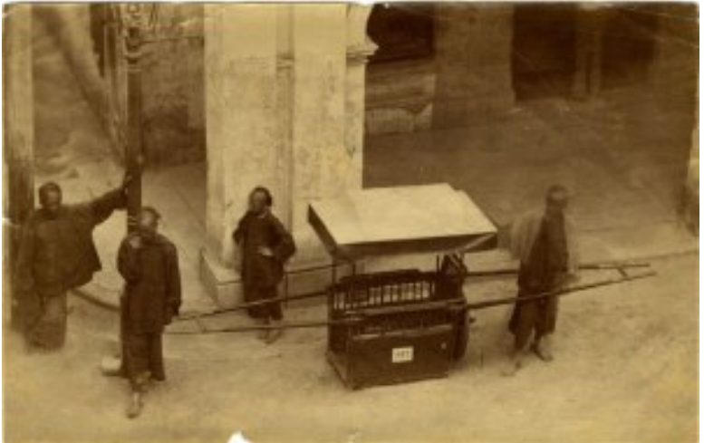
Figure 2 - Young Rickshaw Workers. One Of The Most

Chinese workers were, unquestionably, what made America great. Tireless, unpretentious, and able to live with -very- little. Against an average wage of $2, they earned only ¢40. Half of which went to their dear ones. Another point in favour, they emigrated alone. No dead weight, no distraction. Moreover, centuries of Imperial Dynasties had forged them to complete obedience and full submission. The Ultimate Slaves. Uncle Sam did not need much to oppress them, shamelessly, and to the fullest. Unsurprisingly.