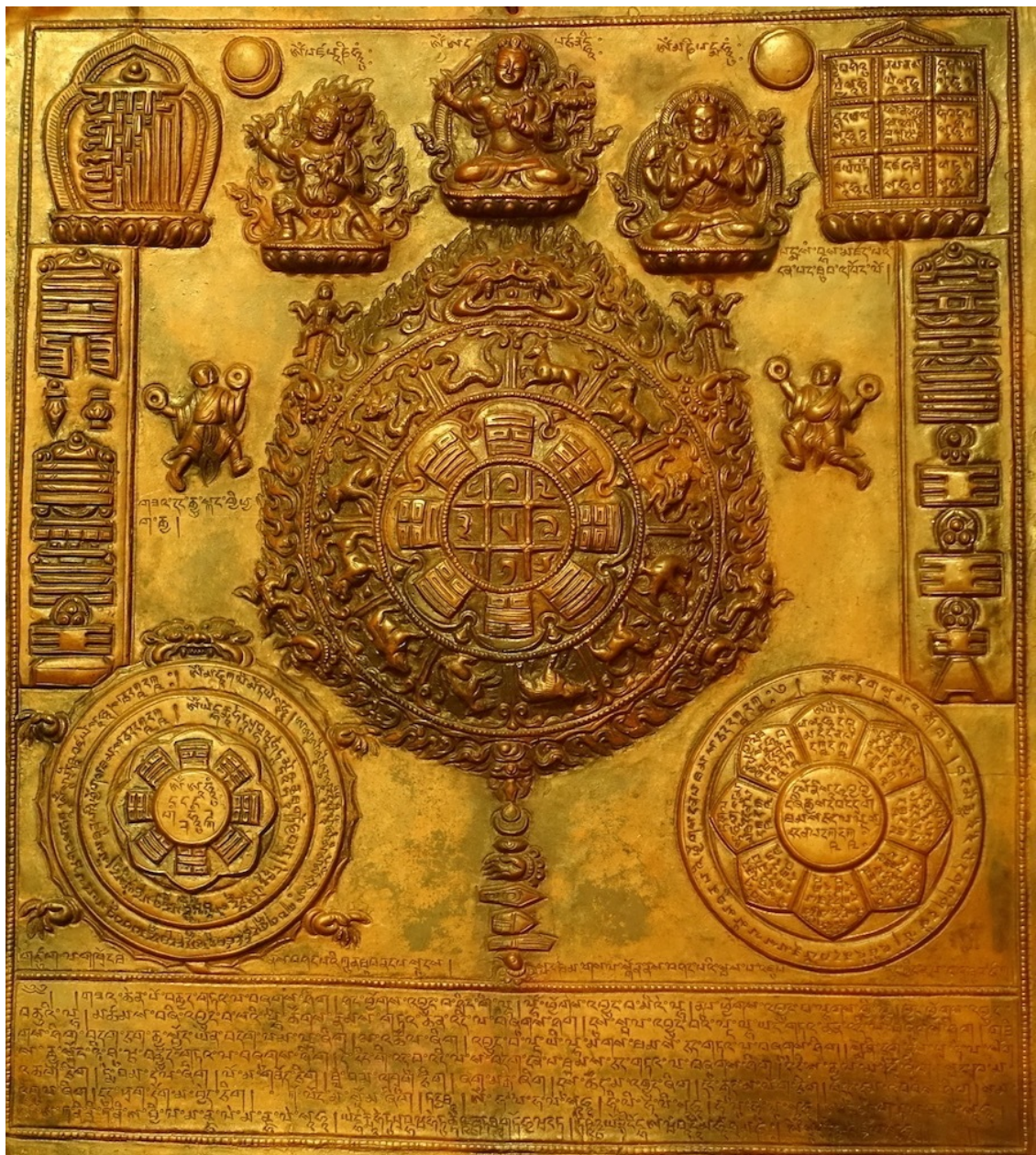
Tibetan astrological tanka, XIX century

Animals are universal multivalued symbols. In particular, they determine the personal characteristics that a person receives. The general psychological portrait of the 12 Animals can be found in the corresponding chapters of this book.