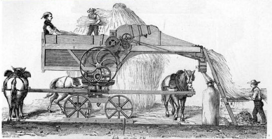
Fig. 319. — Batteuse Dumez à manège direct placé sous la batteuse.