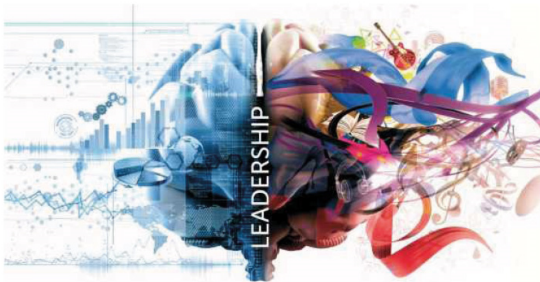
Figure 2. A Combination of Leadership Competencies

This realization underscores that potential exists within everyone. The question is how to unleash it. What skills should be developed to become a manager who does not merely issue instructions but instead leads toward collaborative and sustainable development, helping to overcome challenges?