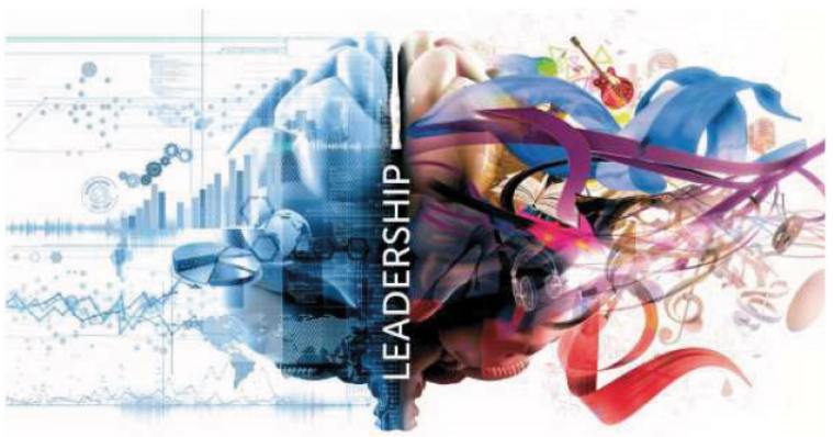
Figure 2. A Combination of Leadership Competencies