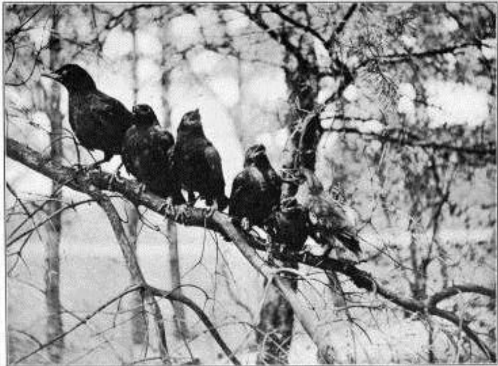
A CROW CHORUS