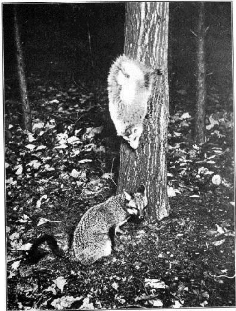
BR'ER FOX AND BR'ER POSSUM