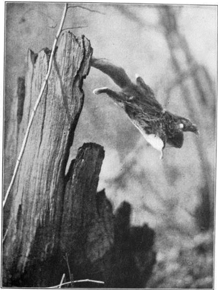
FLYER, THE SQUIRREL